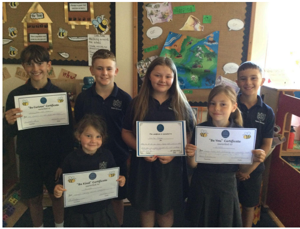
This week's certificate winners